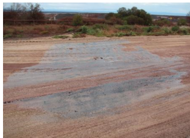
Hydraulic oil leak from truck