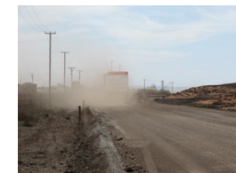
Fugitive dust from vehicle