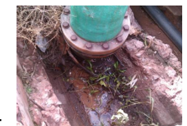
Ongoing water leak requiring action