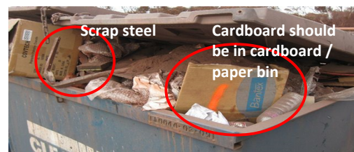
General rubbish bin – waste not segregated