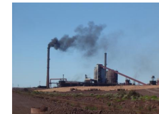
Dark stack emissions