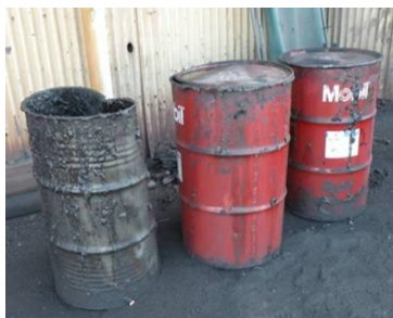
Damaged drum with no lid, unbunded drums