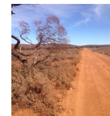
Unauthorised vegetation clearance