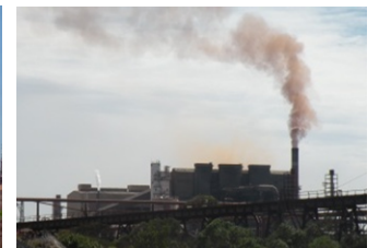
Pollution control equipment not functioning