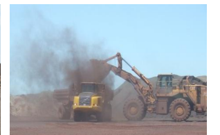
Material handling dust