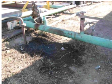
Oil leak to unsealed ground