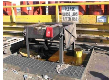
Bund full of water & rubbish