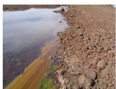
Oil spill into ponds

Enter all environmental incidents into MyCority – Environmental Event. Enter actions to prevent reoccurrence